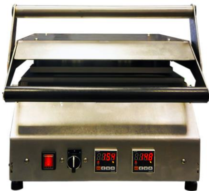
On Seal Manual