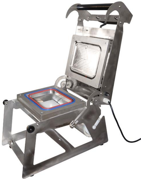
On Seal Mini

Designed for a spot tray sealing, even in small benches. Ideal for leak-free ready meal delivery.