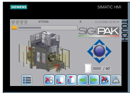
9" COLOR TOUCH SCREEN